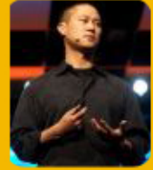
Tony Hsieh, CEO - Zappos, TiECon Silicon Valley 2009