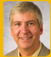
Rick Snyder Republican candidate, Governor of MI