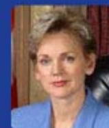
Jennifer Granholm Governor of Michigan